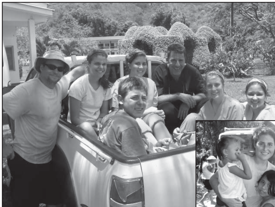
Trinity alumni and students participate in the All Saints Church mission trip to Honduras